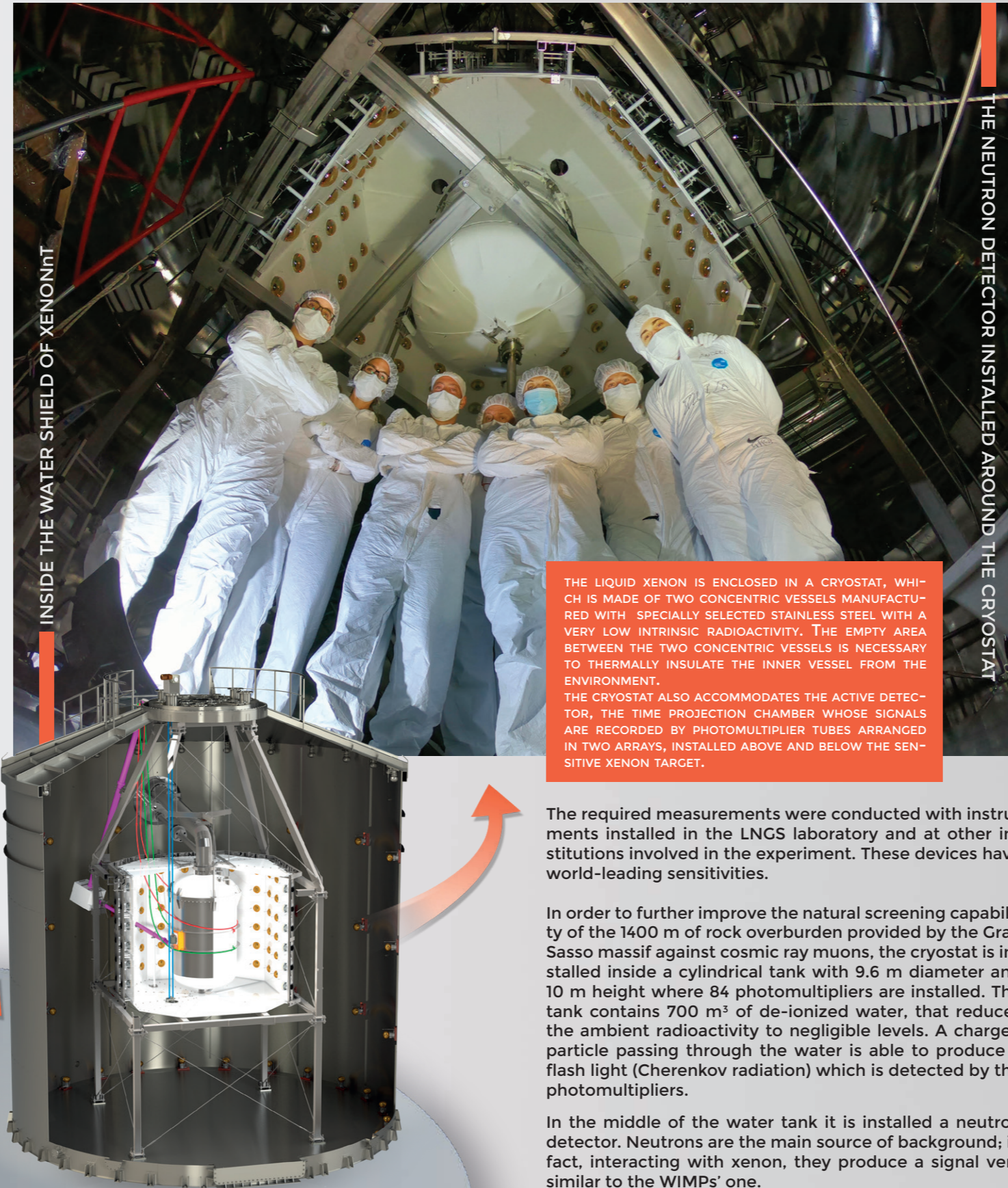
INSIDE THE WATER SHIELD OF XENONnT