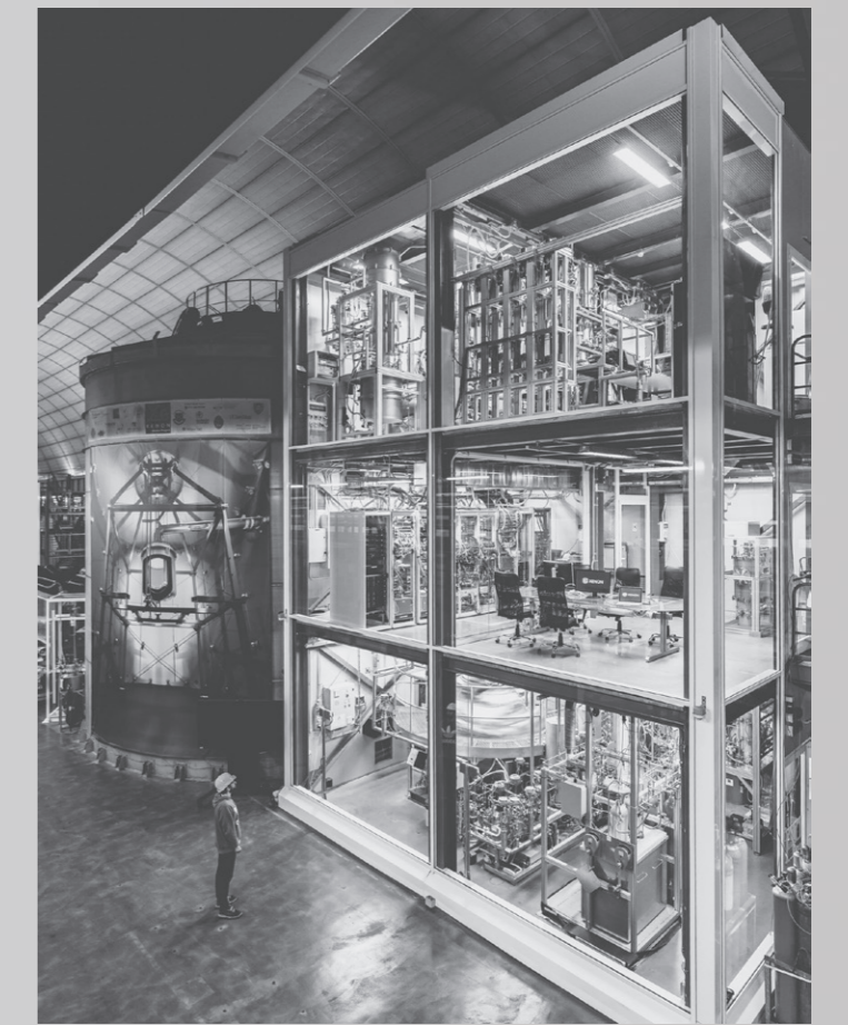
The XENONnT experimental facilities underground in Hall B.

The bottom floor hosts the custom storage system of the precious stock of xenon. This device can store up the full amount of xenon (8.5 t) in safe conditions in state of matter, gas, liquid and even solid. In case of an emergency situation, it allows to recover the xenon from the cryostat in few hours. At the same floor there is a 5m high distillation column, which removes from the xenon minute amounts of krypton (one atom per ten thousand billions of Xe atoms) able to produce unexpected events. A similar distillation column is installed at the top floor to remove Radon atoms, another important potential contaminant.