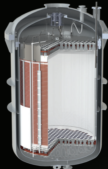
The XENONnT Detector during Assembly (Left) and Design (Right).